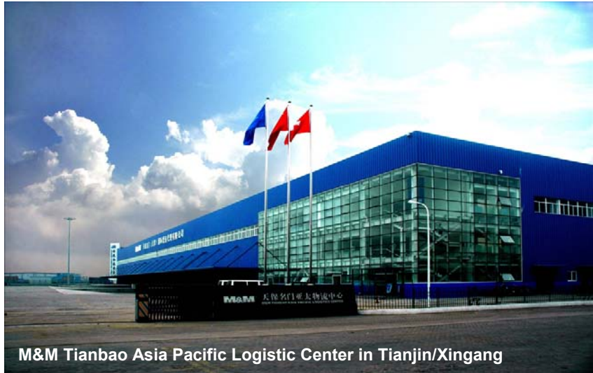
M&M Tianbao Asia Pacific Logistic Center in Tianjin/Xingang

- The M&M APLC is situated at the New Euro-Asian landbridge funded by the Chinese government. Therefore, the terminal will be of direct importance also for the transit